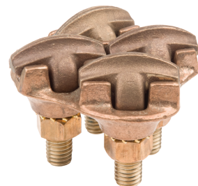
G47541 for four plain plug ferrules