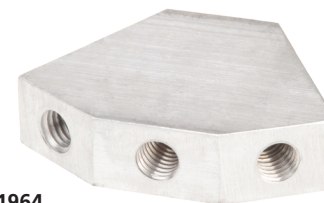
T6001964 for four 3/8-11 UNC threaded ferrules