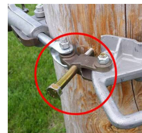
Penetrating Retro Kit (T6001549AR) is circled and is included with T6001549A