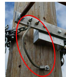
Penetrating Retro Kit (C6000152AR) is circled and is included with PSC6003628A